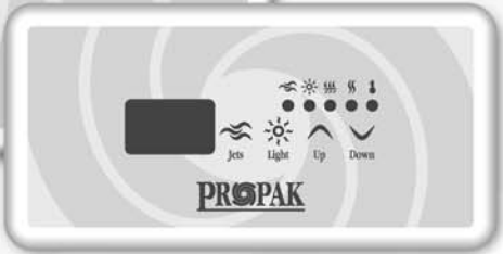
TSC-18 (5" • 2 1/2")

The Quick Reference Card provides a quick overview of your spa's main functions and the operations accessible with your digital control pad.