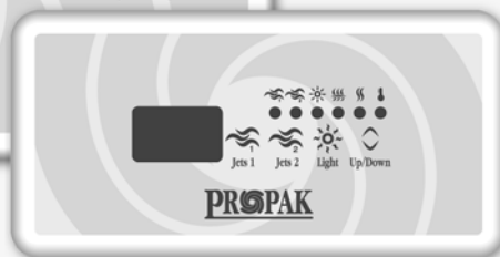
TSC-18 (5" • 2 1/2")

The Quick Reference Card provides a quick overview of your spa's main functions and the operations accessible with your digital control pad.