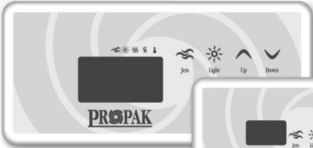
TSC-19 (7" • 3 1/4")